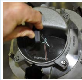
Illuminated view ports permit observation of product during operation.

©2014 Heat and Control Inc. UVF.4.18.2014 Patent pending.