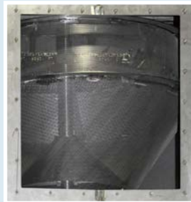
Integrated centrifuge reduces finished oil content of product.