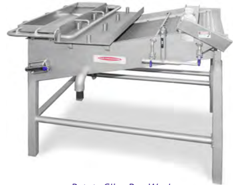
Potato Slice Pre-Washer with slicer mount and flume.

Constant improvement and engineering innovations mean these specifications can change without notice.