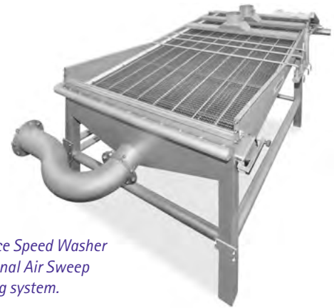
Potato Slice Speed Washer with optional Air Sweep dewatering system.